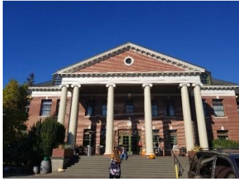
Entrance to Grand Lodge of Oregon AF & AM

Following the tour of the hospital, and lunch at