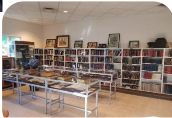
Grand Lodge library

McMenamins, the staff of the Oregon Grand Lodge made everyone feel welcome when they made a special effort to open the building (normally closed on weekends) for a tour.