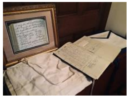
Masonic Aprons & Union Visitor Register

"The intent of the evening was to pay homage to our local history, a tribute to our deceased brothers, reliving an experience to which they too would have done, all while enjoying the evening and the fellowship among other brothers." said one member of the Lodge.