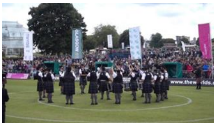
Northwest Junior Pipe Band placed 5 th in Glasgow 2015 world championships

The Northwest Junior Pipe Band, one of our sponsored charities, is a Novice/Grade 4 and Grade 5 youth bagpipe band based in North Seattle/Shoreline. It is the only youth competition pipe band in Washington. The