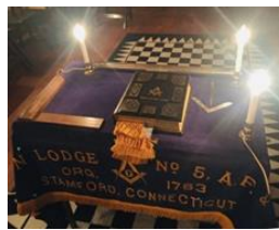
Union Lodge Altar

Lodge and even the Master of Union for a few consecutive years.