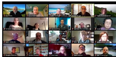
St. John's Brothers interact every Wednesday

For those brothers who haven't provided your email address to the Secretary, you're really missing out on a lot of Masonic communication between postal mailings. Our Zoom get-togethers are only one of many ways we've been keeping in touch. Don't be a lonesome wolf. Don't just howl in the wind. We're all here for each other.