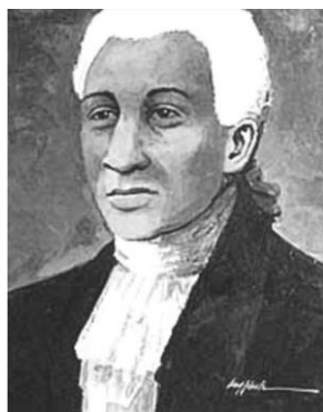
Prince Hall, founder of the Prince Hall Masons

Masonic leadership in civil rights has not been limited to lawyers. We know the names – Medgar Evers, Benjamin Hooks, A. Phillip Randolph, and currently Congressman John Lewis, and beloved late Congressman Elijah Cummings. [cont. bottom page 6]