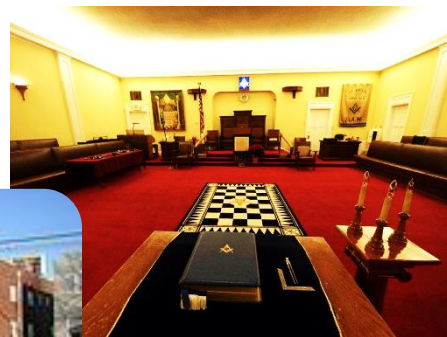
St. John's Lodge room stands empty since February