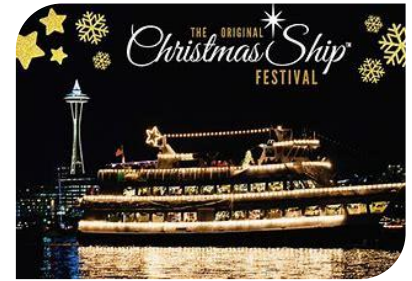
St. John's Lodge sponsoring Cruise on Christmas Ship Thanksgiving weekend