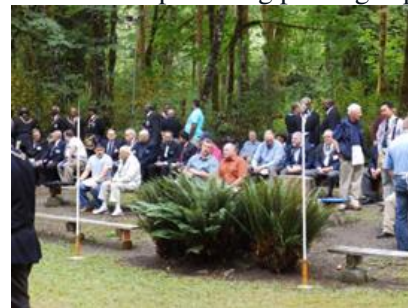
Masons assembled at open Lodge room, not available this year

That will provide a good location with privacy to conduct the degree for the candidates. Honor Roll is just after where the road turns one-way. Millcreek Lodge 243 brothers are providing parking support and will show you the parking location.