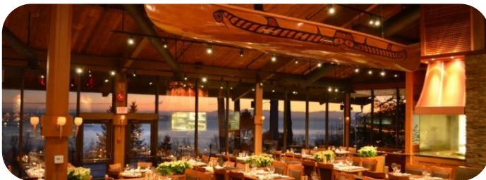
Ivar's Salmon House views downtown Seattle from Lake Union

A beverage bar will be available, as well as an assortment of wines for each table. Dress is evening attire for the ladies, suit and tie for the gentlemen.