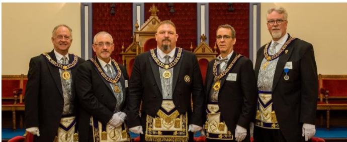
Grand Lodge team welcomes you to 166 th communication

Due to the nature of the electronic voting system, attendees of the 2023 Annual Communication MUST PRE-REGISTER through the Grand Lodge website.