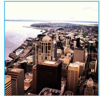
View from Columbia Tower