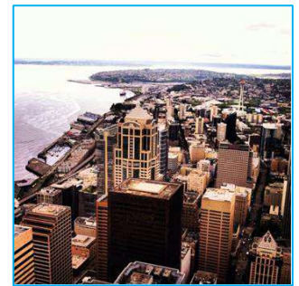
View from Columbia Tower