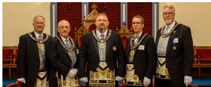
Grand Lodge team welcomes you to 166 th communication

Due to the nature of the electronic voting system, attendees of the 2023 Annual Communication MUST PRE-REGISTER through the Grand Lodge website.