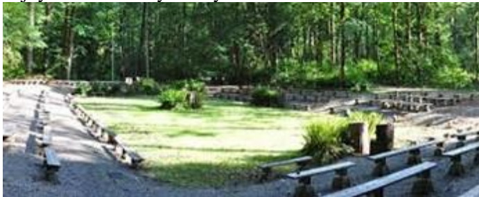
Open Air Lodge Room (looking west)

The cost for entry at the Masonic Park is $7.50 and will be collected at the gate. So, break out your favorite lawn chair and come out to the Masonic Family Park and enjoy a summer day with your Brethren..