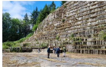
View of Tenino Quarry Wall

“If you do not possess strong willpower and wish to rectify that, use Bluestone Rock to achieve more determination as this stone activates the solar plexus chakra, which encourages you to take control and take responsibility for your own