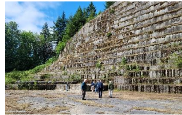
View of Tenino Quarry Wall

“If you do not possess strong willpower and wish to rectify that, use Bluestone Rock to achieve more determination as this stone activates the solar plexus chakra, which encourages you to take control and take responsibility for your own