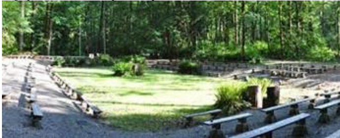
Open Air Lodge Room (looking west)

The cost for entry at the Masonic Park is $7.50 and will be collected at the gate. So, break out your favorite lawn chair and come out to the Masonic Family Park and enjoy a summer day with your Brethren..